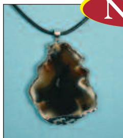
NAASN – Sliced Agate Pendant w/Silver Plated Edge, approx. 1.5” x 2” on Leather Cord