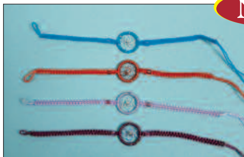
MJDCFB – Dreamcatcher Friendship Bracelets Asst'd Colors