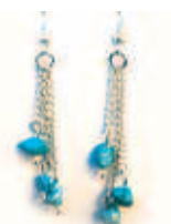
WTDE – 3 Genuine Turquoise Drop Earrings