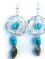
WTWE Genuine Turquoise Wire Earrings