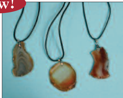
NASAP – Sliced Agate Pendants Approx. 1” x 1.5 on Leather Cord Various Shapes and Colors