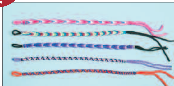
MJFB – Colorful Woven Friendship Bracelet Asst'd Weaves and Colors